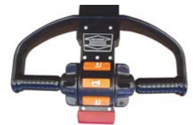
Control Handle Wraparound Hand Guard