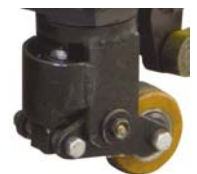
- Optional - Spring Loaded Stability Casters